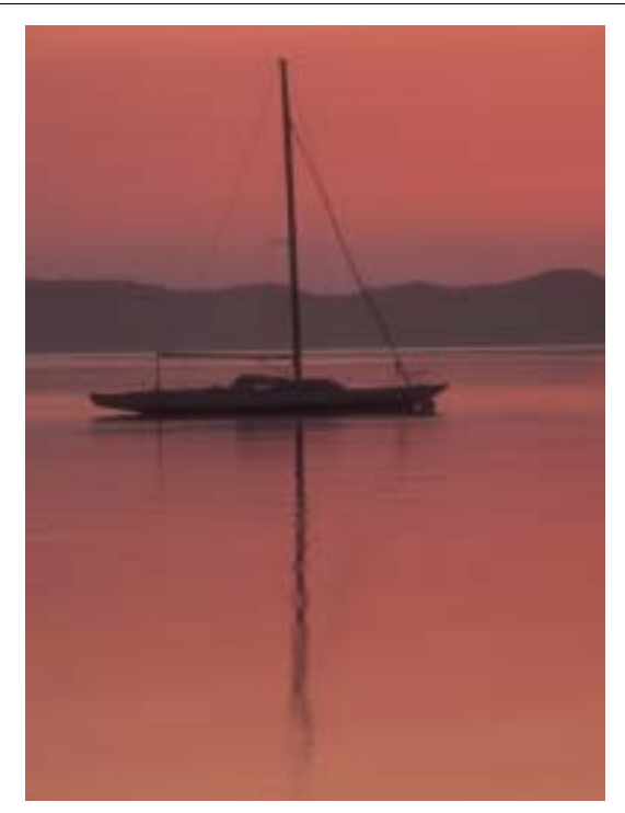
Sailboat at Sunset