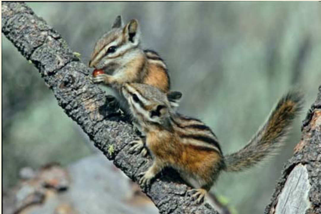
Are-You- Gonna-Share ?