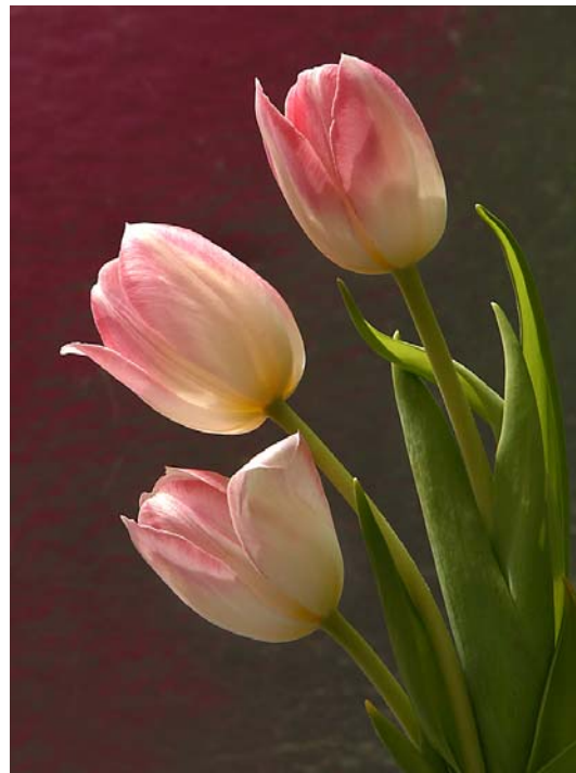
Pink Tulip Trio