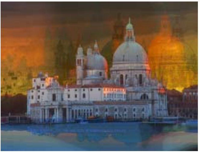
Santa Maria della Salute