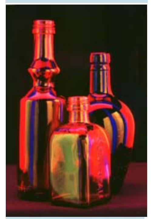
Bottles Reflecting Fluorescent Colors Della O'Malley