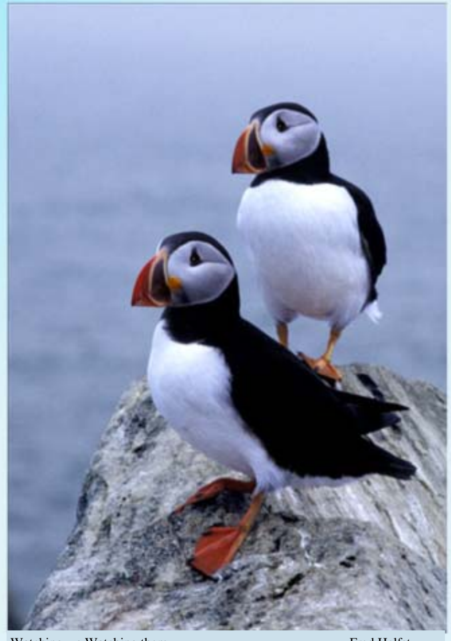
Watching us Watching them