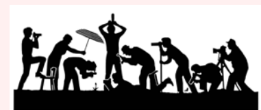
Ridgewood Camera Club