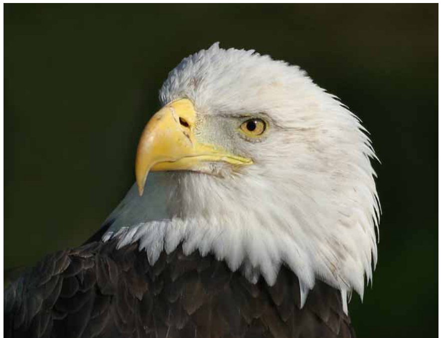
Print of the month